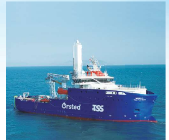
Service Operation Vessel (SOV)

Please Contact Us: DP Simulator Division, MOL Marine & Engineering Co., Ltd.