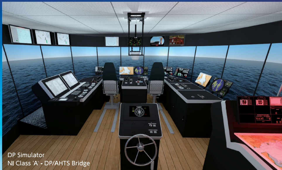
DP Simulator NI Class 'A' - DP/AHTS Bridge

You will receive top-quality education and training to attain DP knowledge, skill and course certificate.