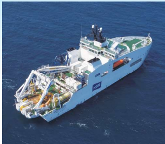
Cable laying vessel

Our DP Simulator is a replica of a DP vessel bridge and includes a real DP system from KONGSBERG.