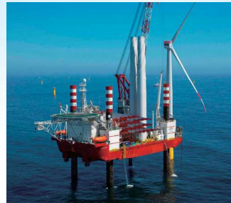
Self-Elevating Platform (SEP Vessel)